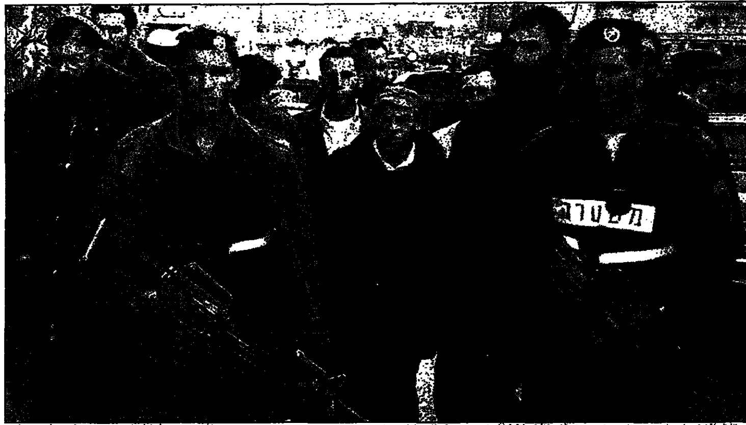
Yisrael Ba'aliya head Natan Sharansky (center) walks through Hebron yesterday guarded by border policemen and accompanied by settlers.

According to Israel Radio, the Palestinians handed over to Israel the names of the 400 Palestinian policemen who are expected to take up positions in Hebron as well as the serial numbers of their weapons, but IDF sources could not confirm this. The Hebron agreement calls for the Palestinian police to pass an internal security check "in order to verify their suitability for service."